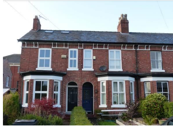
The eaves cornice on Nos. 2 to 5 Brogden Grove.