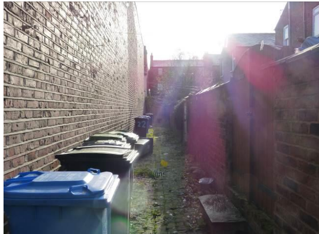
A ginnel with cobbled floor and brick yard walls (right).

secondary status which should be kept as part of the overall hierarchy of space within the Conservation Area.