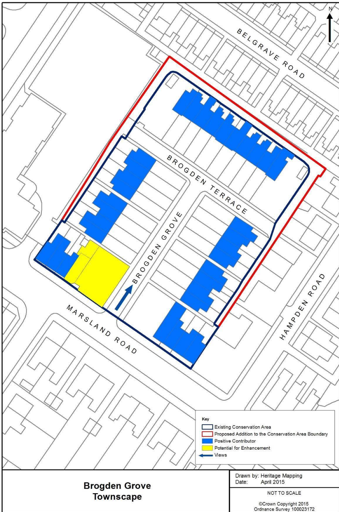
Map 2: Townscape analysis