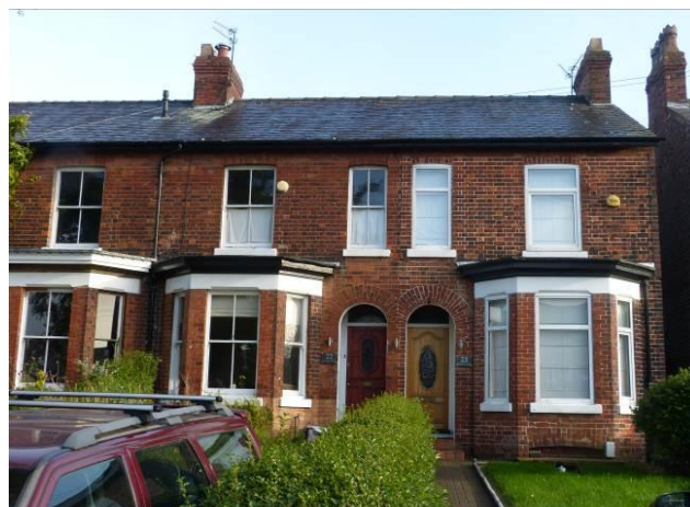
Inappropriate replacement windows at No. 23 Brogden Grove, with transoms which disrupt the rhythm of the wider terrace's fenestration.