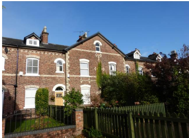
The central block of Brogden Terrace, with attic dormers on either side and detailing picked out in contrasting stock brick.