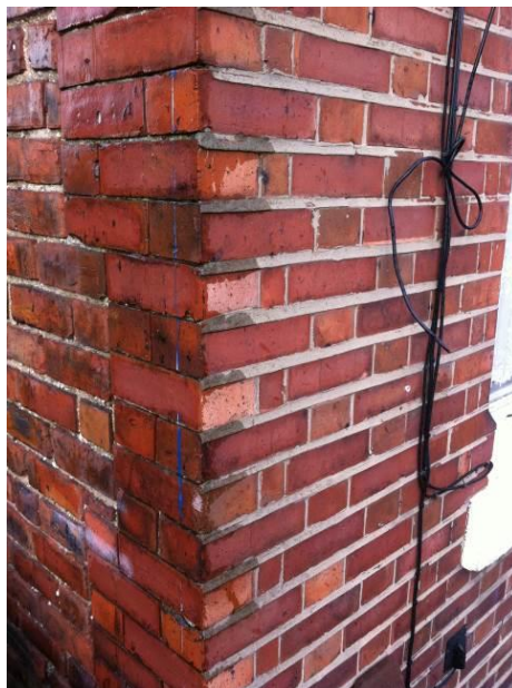
Damaging cementitious ribbon pointing.