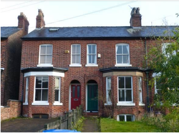
A typical pair of Brogden Grove houses, both with early replacement windows (discernible for their slimmer frames but straight top edge). The doors have been replaced in an appropriate style (see paragraph 2.3.5).