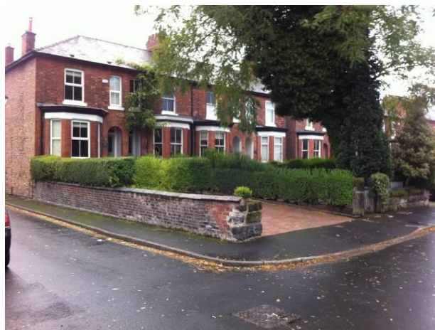
Different boundary treatments, including some original low stone wall which has been extensively replaced with a brick replacement at No. 20 Brogden Grove, possibly when the front garden was converted to off-road parking.

respect the character of the Conservation Area, ideally constructed of unpainted, roughly-hewn local stone and not exceed the established height of existing features.