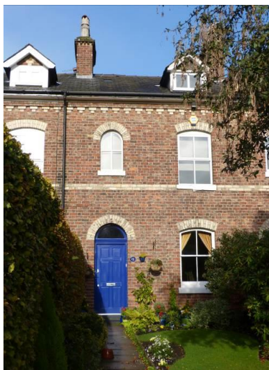
An original ground floor window at No. 12 Brogden Terrace, with later replacements on the upper floors.

proportions of the original opening. Replacement windows should also respect the established line of transoms across the upper levels of the terraces. On Brogden Terrace in particular, windows which curve at the top to fill the whole of the ground and first floor openings (i.e. those which are not squared off with additional framing at the top) are preferable.